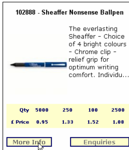
Fig.2: Search Results

The search results are displayed in a grid, showing the product code, product description and unit prices by quantity. A product image is also shown.